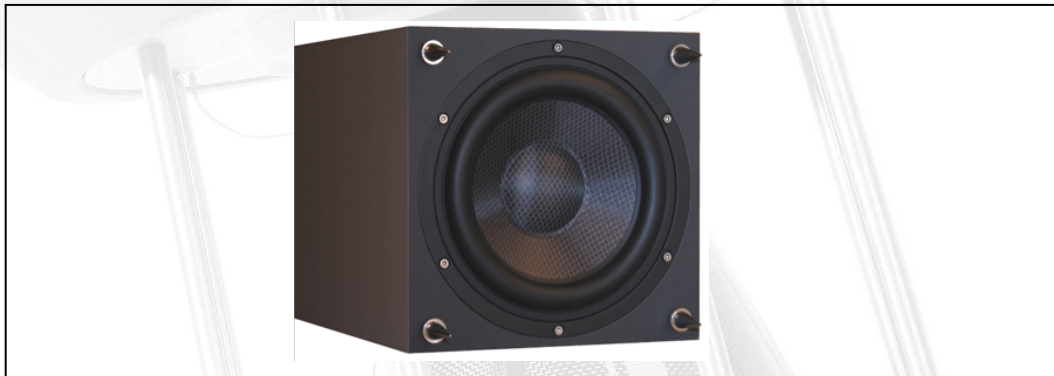
Figure 3. Ultimate Woofer

Please confirm that the cartons contain the following items