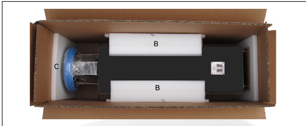
Figure 2. Ultimate Shipping Carton