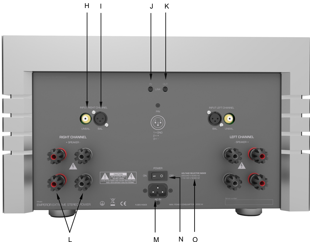
Figure 3. Emperor Extreme Stereo amplifier rear panel.