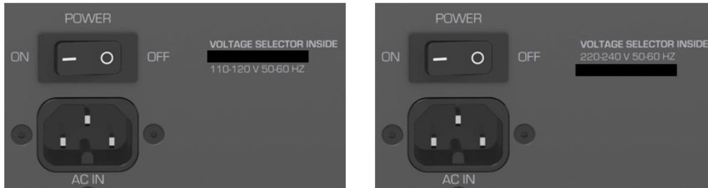
Figure 1. Product operating power supply indication label.

This product should only be connected to a power supply with a voltage included in the range indicated on the back panel as shown below in figure 1. The actual format and position of the labelling may differ from the picture below, but the meaning will be clear.